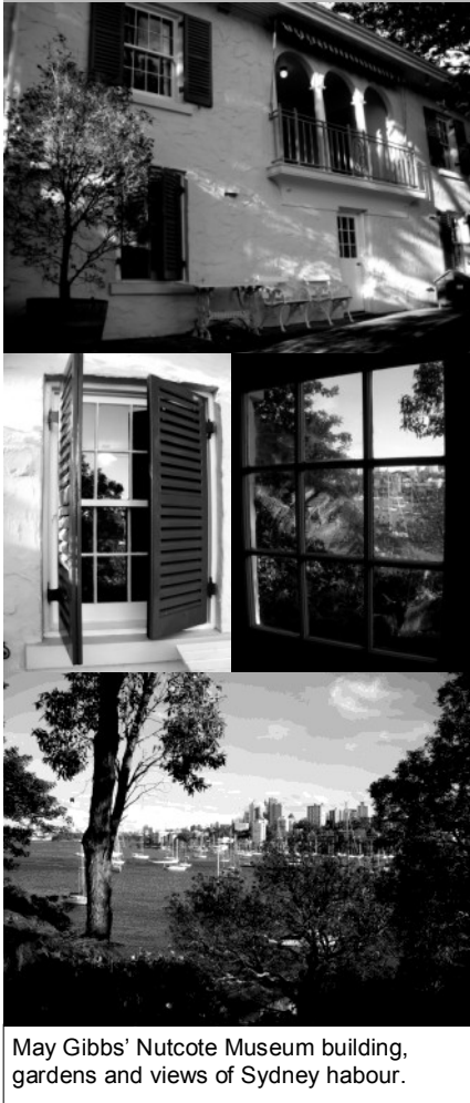
May Gibbs' Nutcote Museum building, gardens and views of Sydney harbour.

May Gibbs Foundation and galvanised support to “Save Nutcote for the Nation”. North Sydney Municipal Council purchased Nutcote for $2.86m in 1990. The house and gardens opened to the public in 1994.