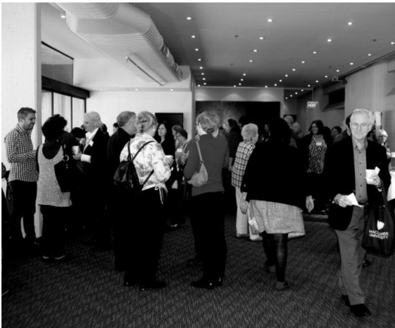
Delegates assemble for the Museums Australia (NSW) symposium, Place, Space and Identity: New Directions for NSW Museums at Macquarie University.