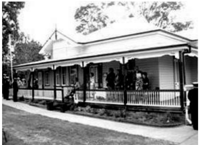
Crawford House Museum, Alston Plateau Historical Society, recipient of funds for renovations from a Government stimulus