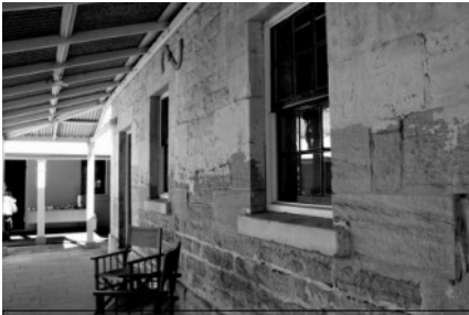
Servants quarters at the Glenalvon Museum