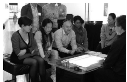
Microsoft Surface touch table demo

If you missed the symposium and want to experience the demo, go to www.touchingthesurface.com.au for case studies and a video based on material from Macquarie University's Touch of Spice exhibition.