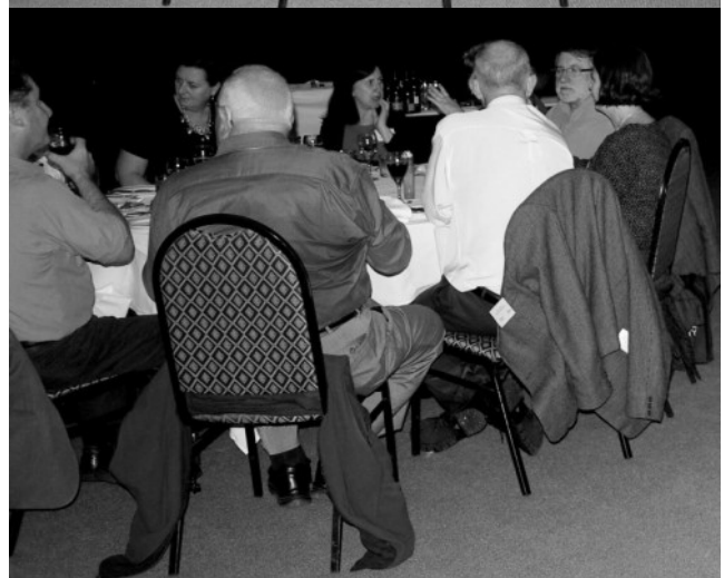
Relationships found new depth as the conversations continued during the social events and symposium dinner.